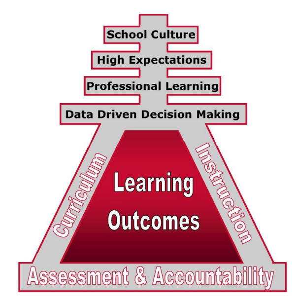
College & Career Readiness

WASC and CEASD Visiting Committees March 22 - 25, 2015